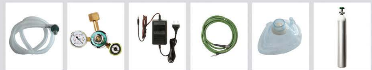
Ventilation hose Regulator Ac adapter Oxygen hose Ventilation mask Oxygen tank - Optional -